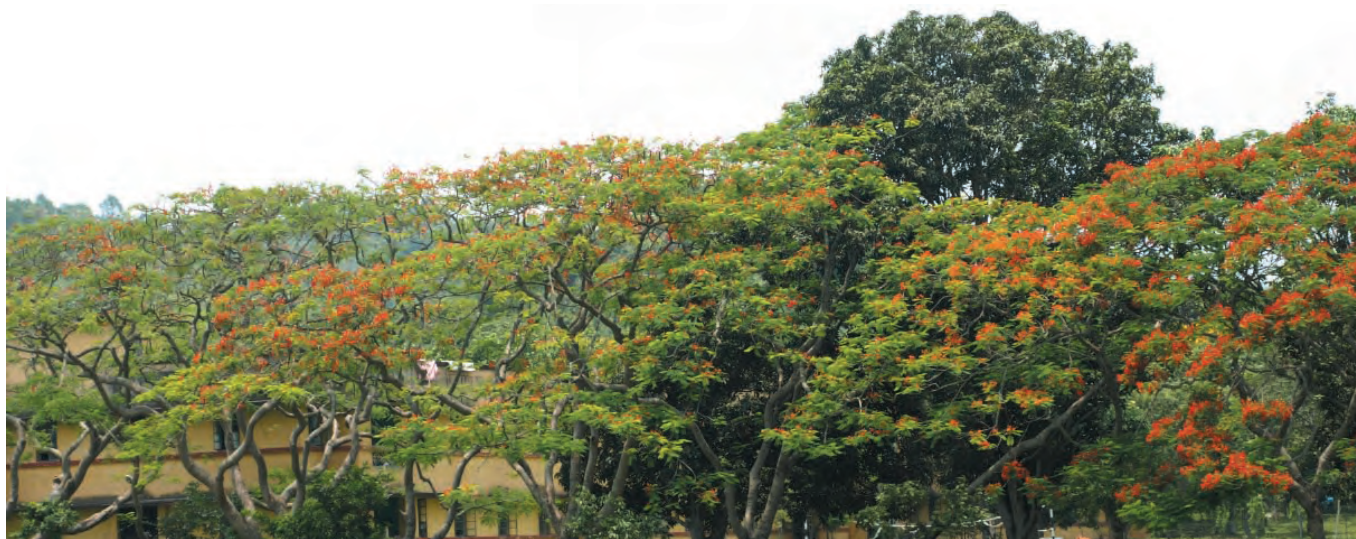
A GU hostel in lush sylvan setting

The Department of Foreign Languages is located in an Assam-type house that is situated to the south of the Main Arts Building, along its left wing. It can be reached from the northern entrance of the Main Arts Building or alternatively, from the path leading from the eastern end of that building (please refer to Map 2 ).