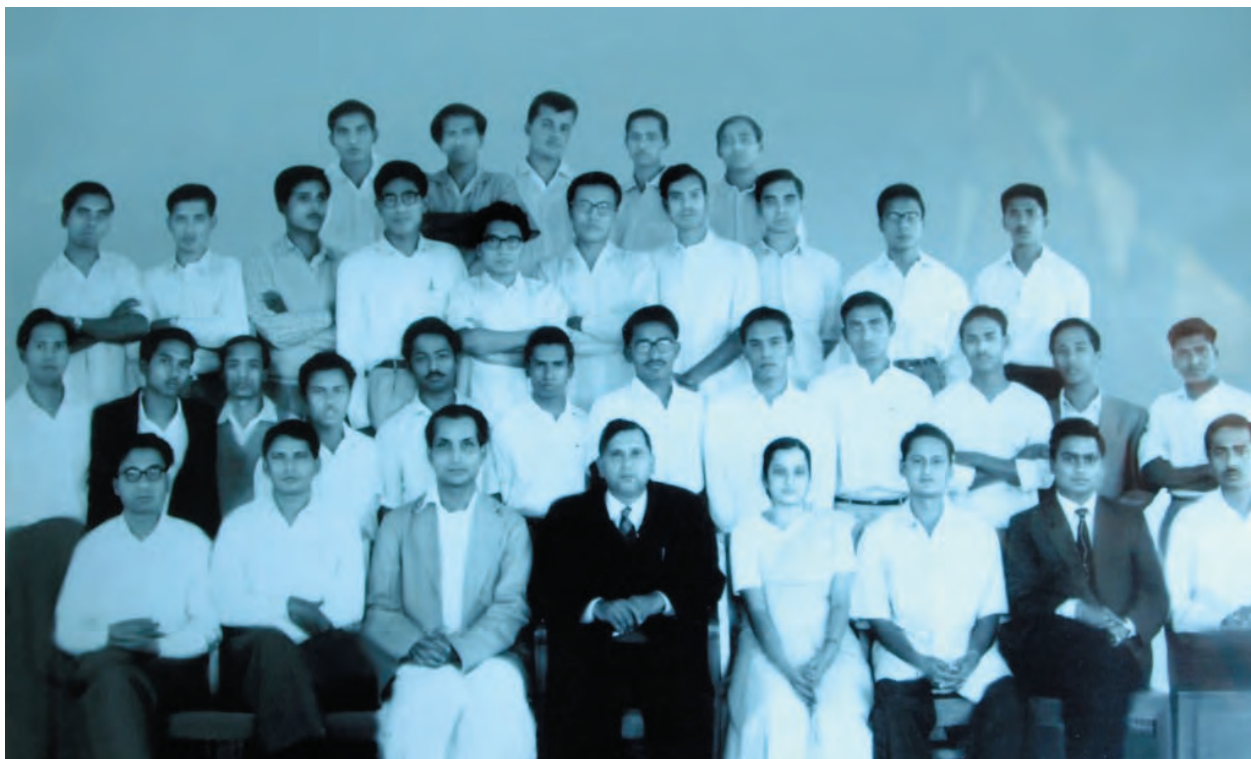
An archive photograph of teachers and students of the Mathematics Department in the early 1960's