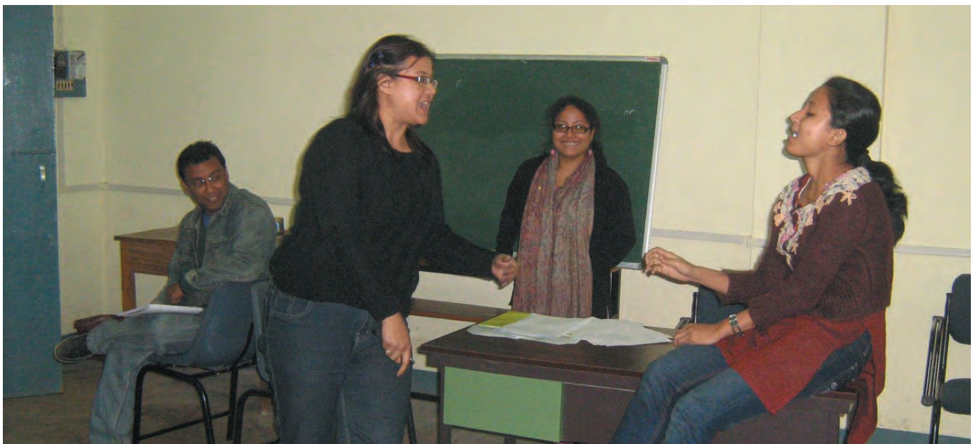
ELT students doing Role Play as an effective language teaching methodology

The Department of English Language Teaching is located in the two-storeyed building behind the Department of Business Administration and to the western side of the Department of Education (please refer to B2 in Map 1 ).