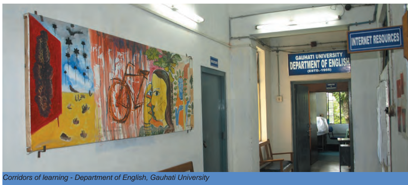
Corridors of learning - Department of English, Gauhati University