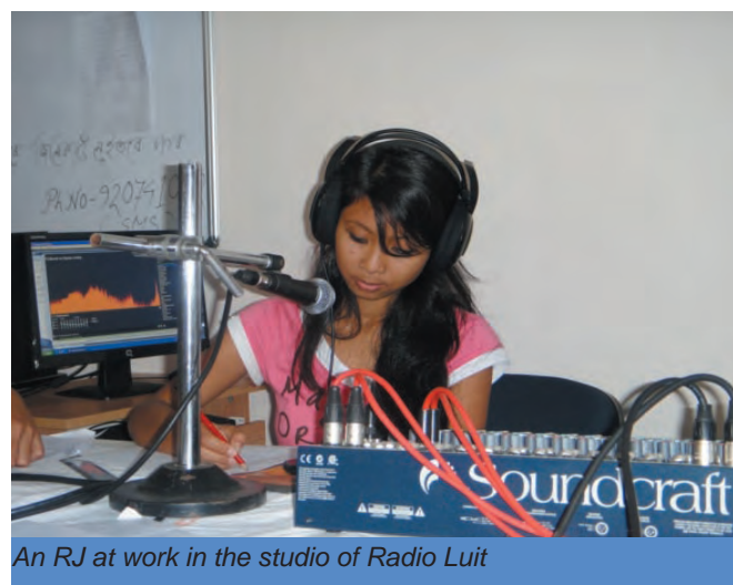
An RJ at work in the studio of Radio Luit