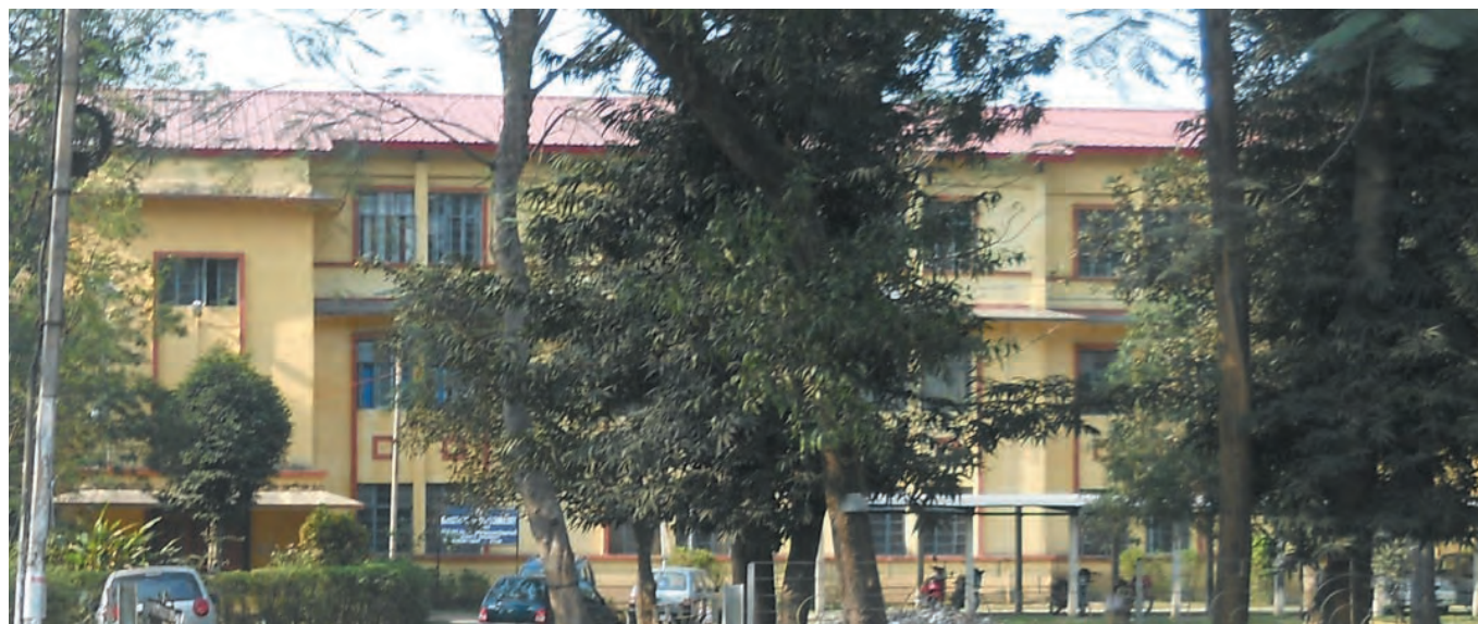
A view of the Department of Biotechnology

The Department of Biotechnology is housed in the right wing of a two-storeyed building situated to the west of the K.K. Handiqui library and Science canteen building. (please refer to A1 in Map 1 ).