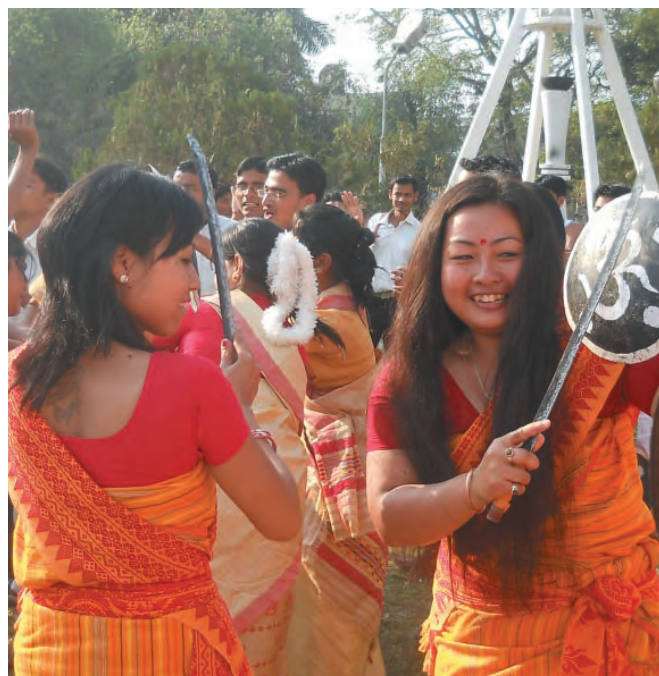
Boro Students participating in a GU cultural event