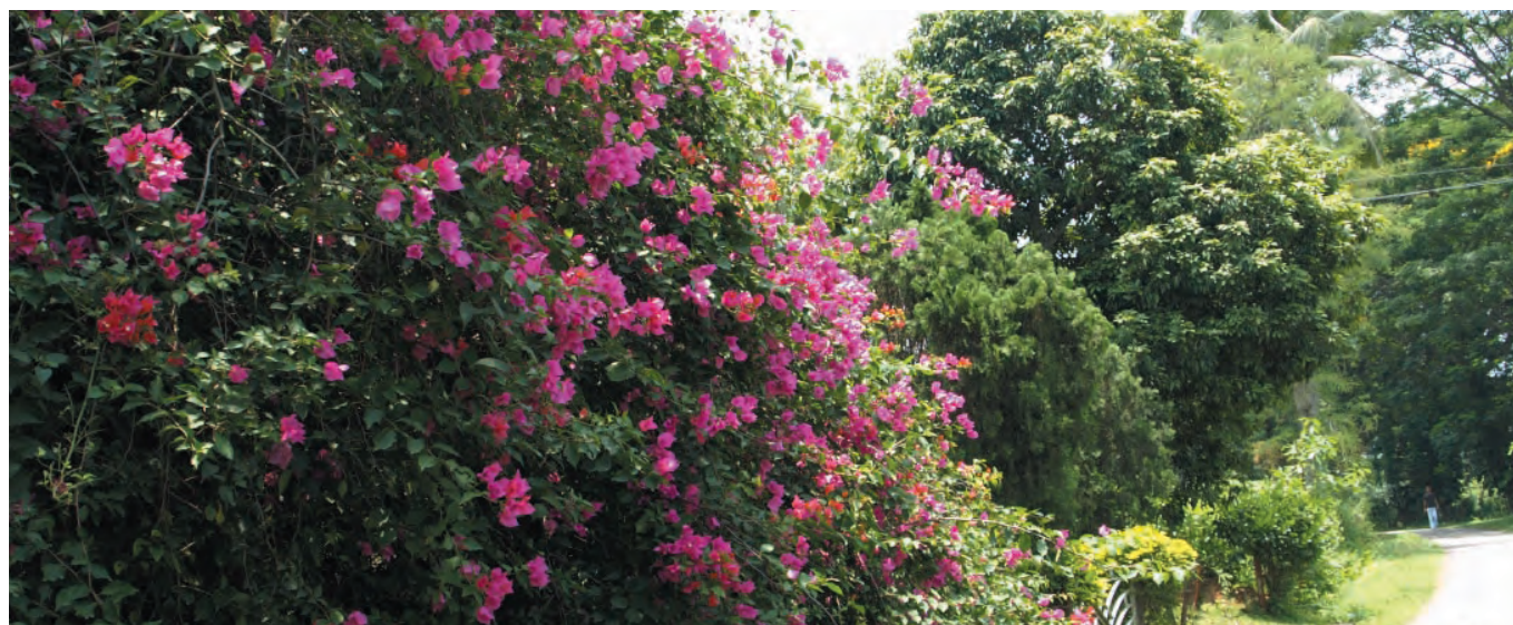
Gauhati University Campus - a floral view

The Department of Education is located to the south of the Faculty House and the MBA Department (please refer to B2 in Map 1 ).