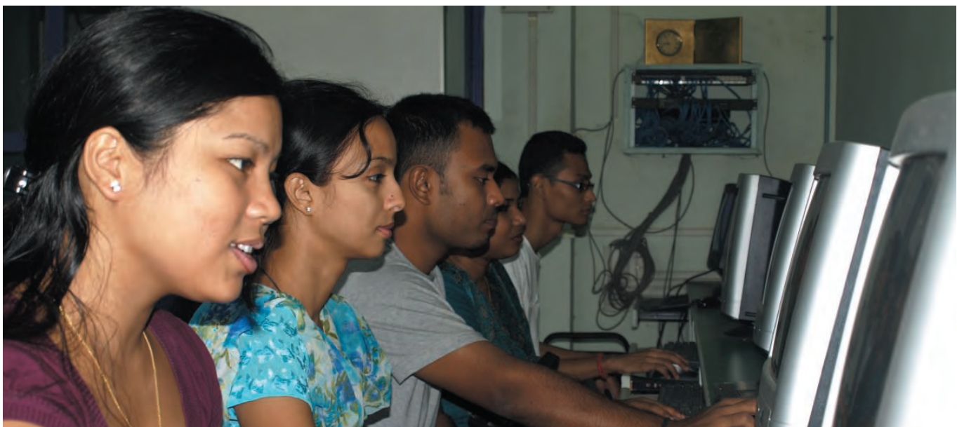
Geography students at work in the computer lab

The Department of Geography is located on the south of NH 37 towards the western part of the University campus. (please refer to B1 in Map 1 ).