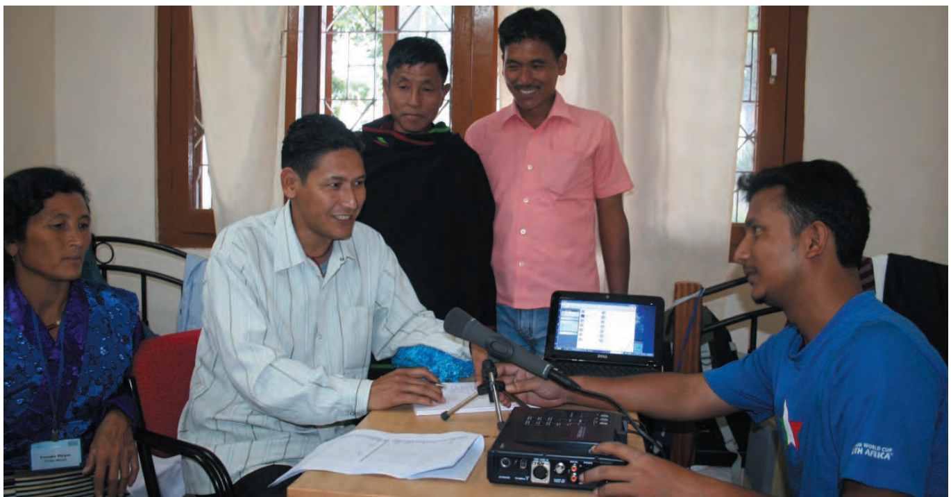
Linguistic Fieldwork on Meyor - an endangered language of Arunachal Pradesh

The Department of Linguistics is located in the two-storeyed building behind the Department of Business Administration and to the western side of the Department of Education (please refer to B2 in Map 2 ).