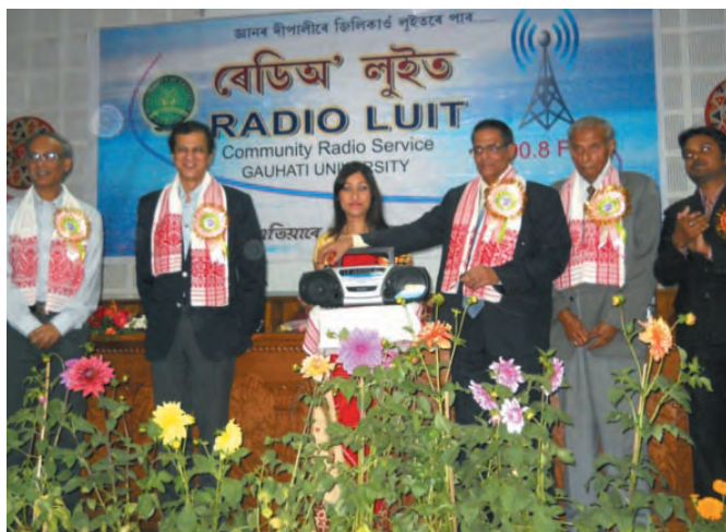
The opening ceremony of Radio Luit

RADIO LUIT , the Community Radio Station of Gauhati University has been set up and stationed at the Institute of Distance and Open Learning, Gauhati University. The station was launched on 1st March, 2011 and operates at 90.8 FM daily from 8AM to 8PM. Last year, Gauhati University obtained the license and frequency 90.8 FM from the Ministry of Information and Broadcasting, Government of India for establishing the Community Radio Station in its campus.