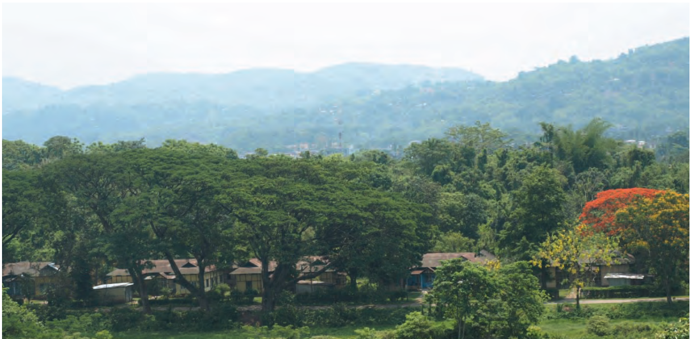
An aerial view of Gauhati University Campus

Students of this Department are serving in various Govt. and Non Govt. Organisations in Assam as Psychologist, Psychological counsellors, teachers and officers. Some such organisations are N.F. Railway, B. Barooah Cancer Institute, Gauhati Medical College, Assam Medical College, Silchar Medical College, LGB Regional Institute of Mental Health, Regional Nursing College, NIPCCD, State Hospitals, Private Hospitals, Blood Banks, Department of Social Welfare, Dibrugarh University, Colleges, Schools, Assam State AIDS Control Society, etc.