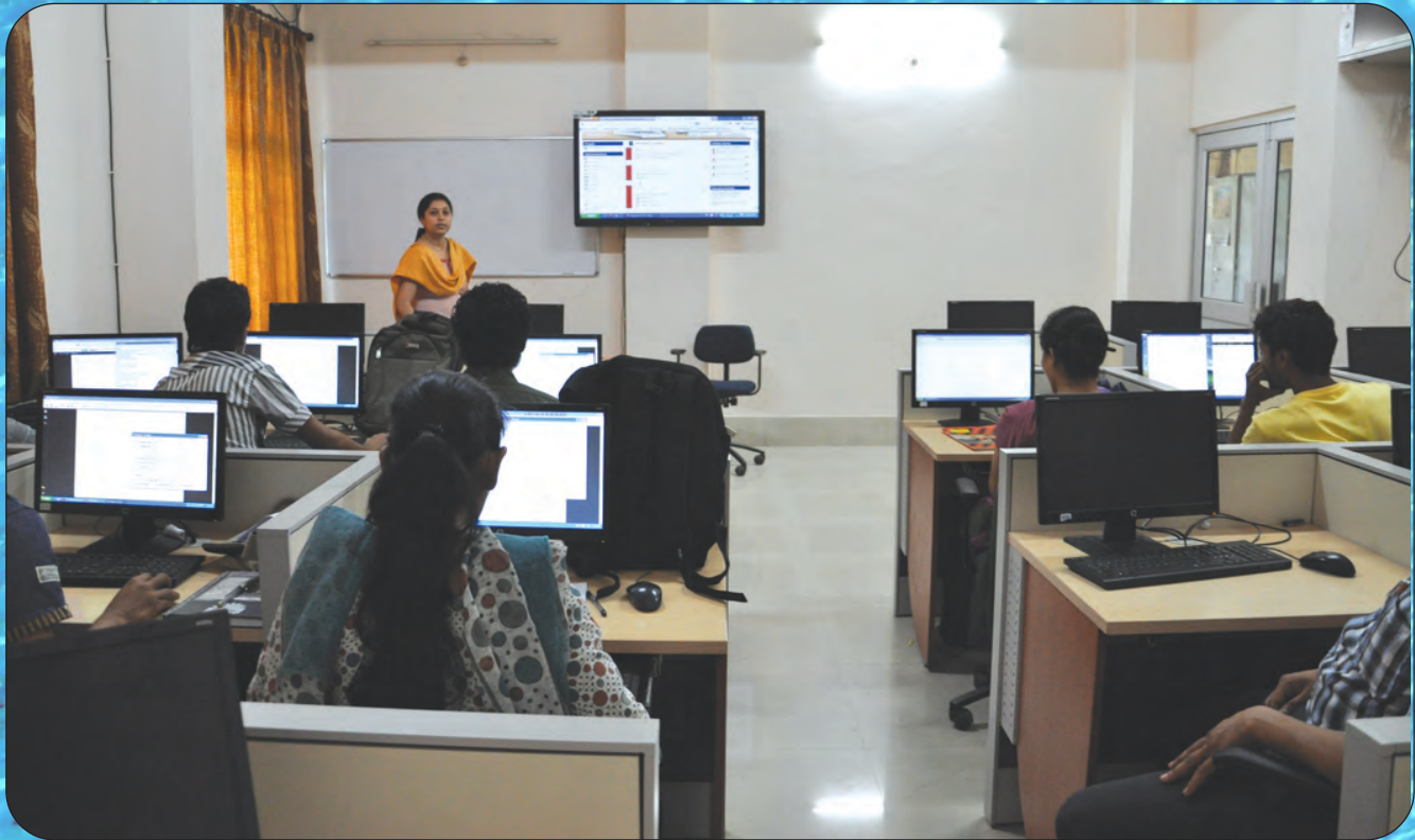
IT Practical Counseling Class in progress