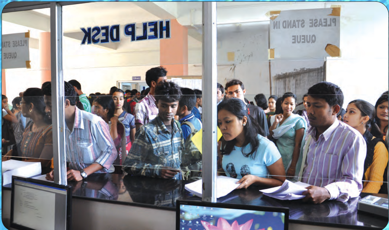
GUIDOL Help Desk