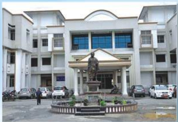
New Academic Building