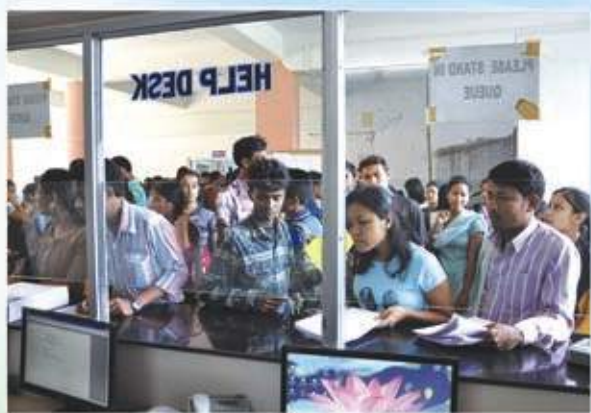
IDOL Help Desk