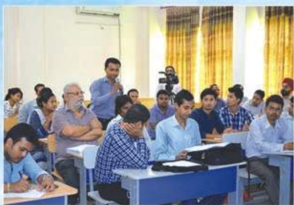
Workshop on Community Radio